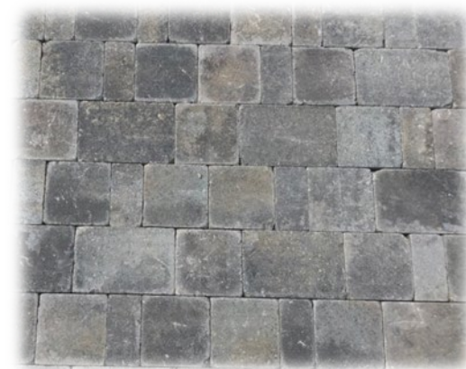
Belgard® Dublin Cobble (Silex Blend)