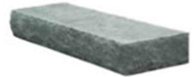
48" Cambridge® Pre-cast Step