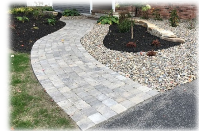
Belgard® Dublin Cobble (Running Bond)

GRASSHOPPER GARDENS, INC. 318 MOTT ROAD - PO BOX 124 GANSEVOORT, NY 12831 OFFICE: (518) 793-9623 www.grasshoppergardens.com