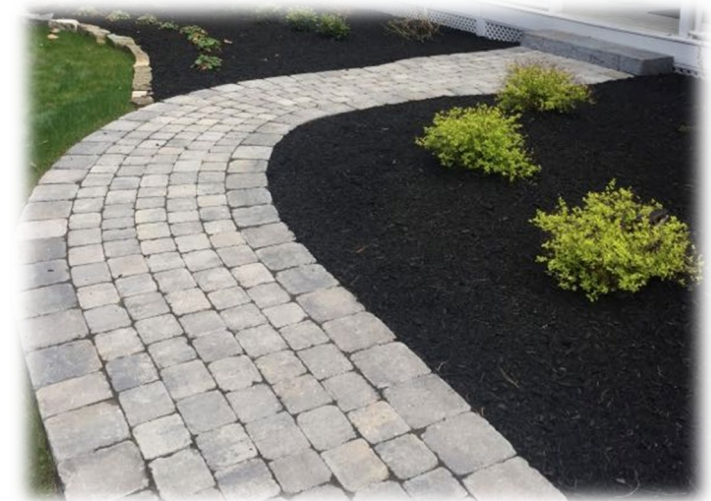
Belgard® Dublin Cobble (Running Bond)

GRASSHOPPER GARDENS, INC. 318 MOTT ROAD - PO BOX 124 GANSEVOORT, NY 12831 OFFICE: (518) 793-9623 www.grasshoppergardens.com