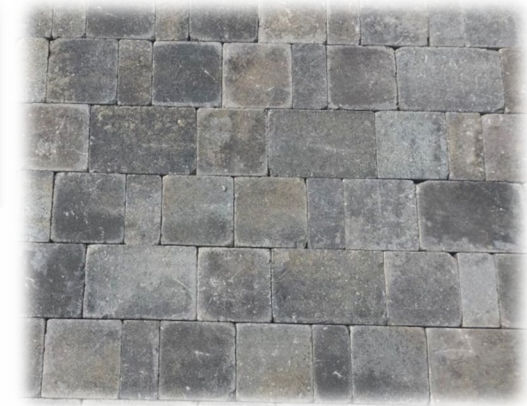
Belgard® Dublin Cobble (Silex Blend)