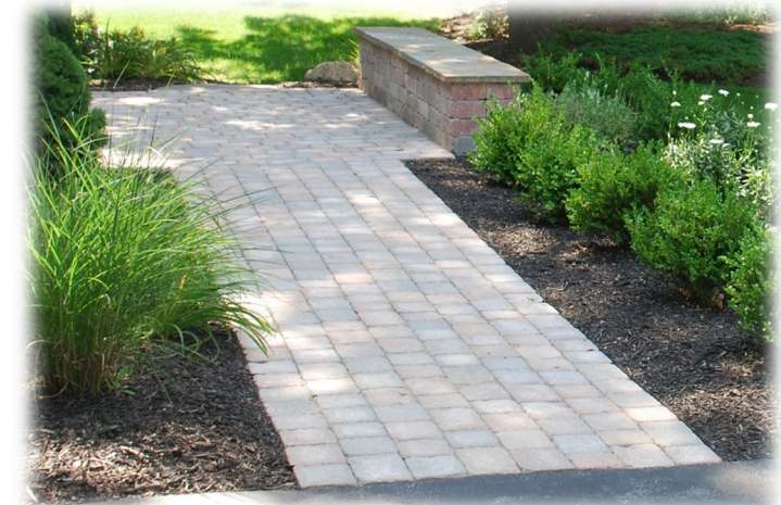
Belgard® Dublin Cobble (Running Bond)

GRASSHOPPER GARDENS, INC. 318 MOTT ROAD - PO BOX 124 GANSEVOORT, NY 12831 OFFICE: (518) 793-9623 www.grasshoppergardens.com