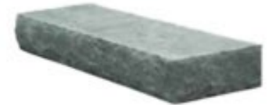
48" Cambridge® Pre-cast Step